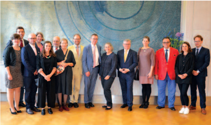
Faculty and guests of honor at the opening ceremony of the summer school 2019