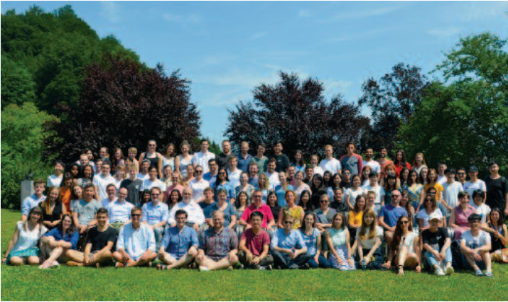
Participants of the summer school 2019